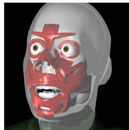
A cut-away image of the embedded muscle structure.

The work was published in the Proceedings of the Euro-graphics/ACM Siggraph Symposium on Computer Animation in 2006. It could prove valuable not only for the entertainment industry but also for predicting the effect that facial surgery will have on expression. □